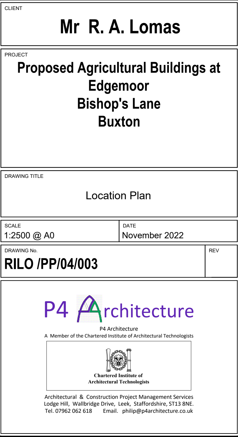
Location Plan 1:2500 scale

THIS DRAWING IS COPYRIGHT AND MUST NOT BE REPRODUCED IN WHOLE OR IN PART WITHOUT THE PRIOR PERMISSION OF P4 ARCHITECTURE. DIMENSIONS TO BE VERIFIED ON SITE. ONLY FIGURED DIMENSIONS TO BE USED AND ANY DISCREPANCY BETWEEN THIS DRAWING AND SITE CONDITIONS TO BE REFERRED TO P4 ARCHITECTURE IMMEDIATELY. NO DIMENSIONS ARE TO BE SCALED OFF PRINTED DRAWINGS UNLESS STATED DIMENSIONS ALIGN WITH THE CORRESPONDING SCALE BAR AND SCALE FILE. ANY AREA THAT ARE INDICATED ON THE DRAWING ARE FOR GUIDANCE ONLY. NO RESPONSIBILITY IS TAKEN FOR THEIR ACCURACY. THERE IS A RISK OF DEATH OR INJURY IN CONNECTION WITH THE WORKS ARE NOT PROPERLY PLANNED AND SUPERVISED. THE CONTRACTOR MUST NOT UNDERTAKE ANY ELEMENT OF WORK WITHOUT HAVING FIRST CARRIED OUT THE NECESSARY RISK ASSESSMENT AND PREPARED DETAILED METHOD STATEMENT.