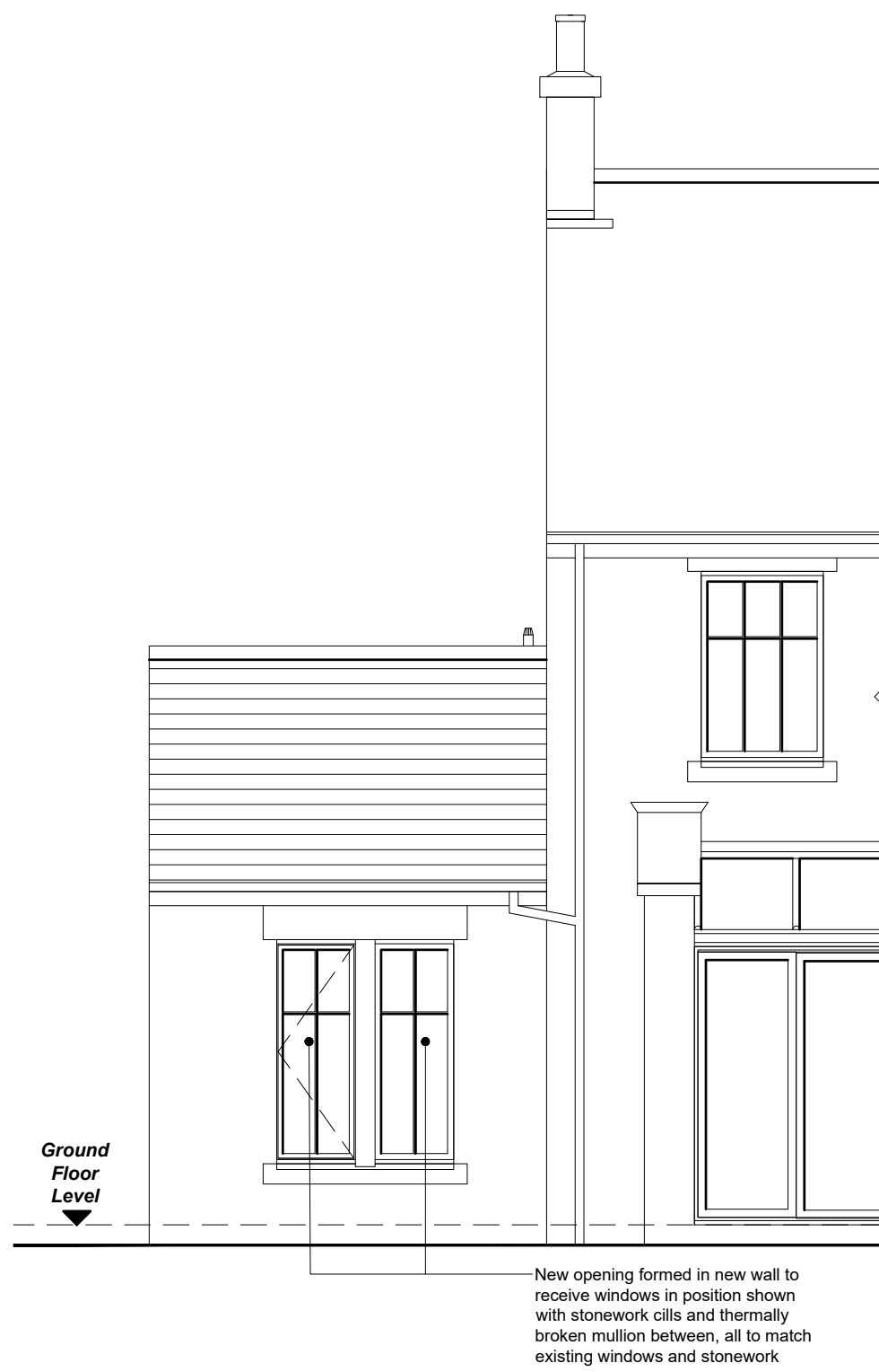
PROPOSED PART REAR (SOUTHERN) ELEVATION