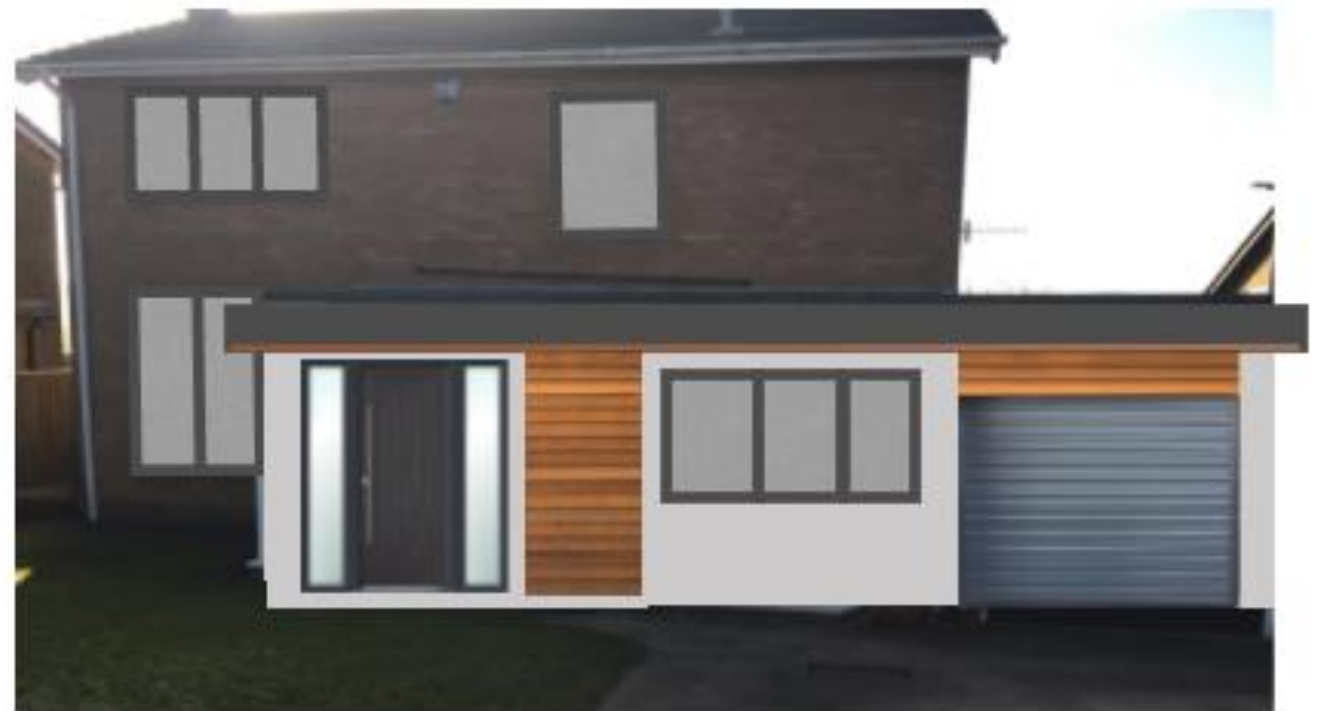
Impression of new front of house with off-white render and cedar cladding