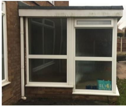
Side View of porch