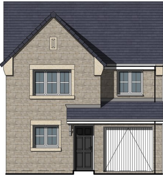
Front Elevation 1:100