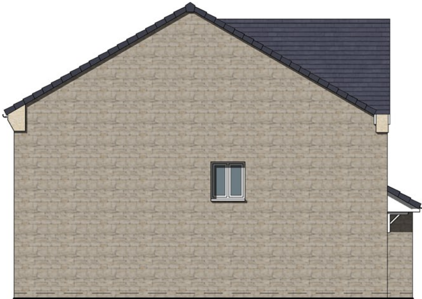
Side Elevation Soldier Course to plots – 01,95

Notes — Copyright in this drawing remains the property of BM3 Architecture Limited. — Do not scale this drawing. Work to figured dimensions only. — Contractors and consultants are to advise BM3 Architecture Limited of any discrepancies.