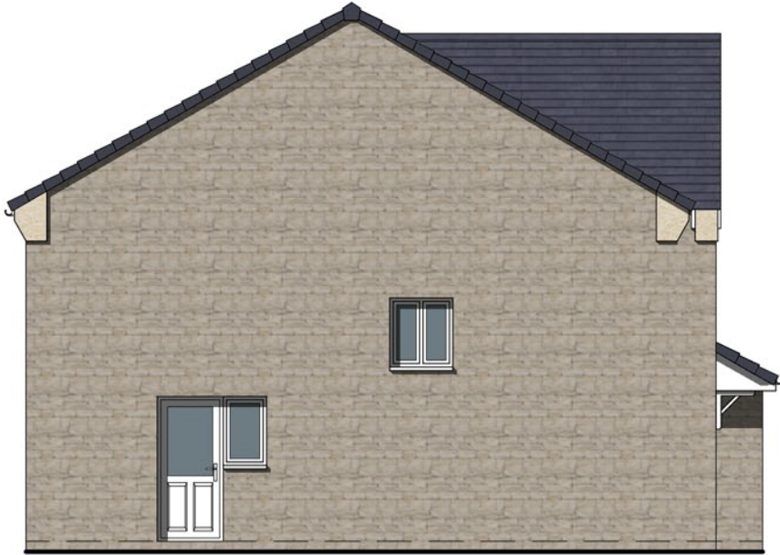
Side Elevation Soldier Course to plots – 01,95