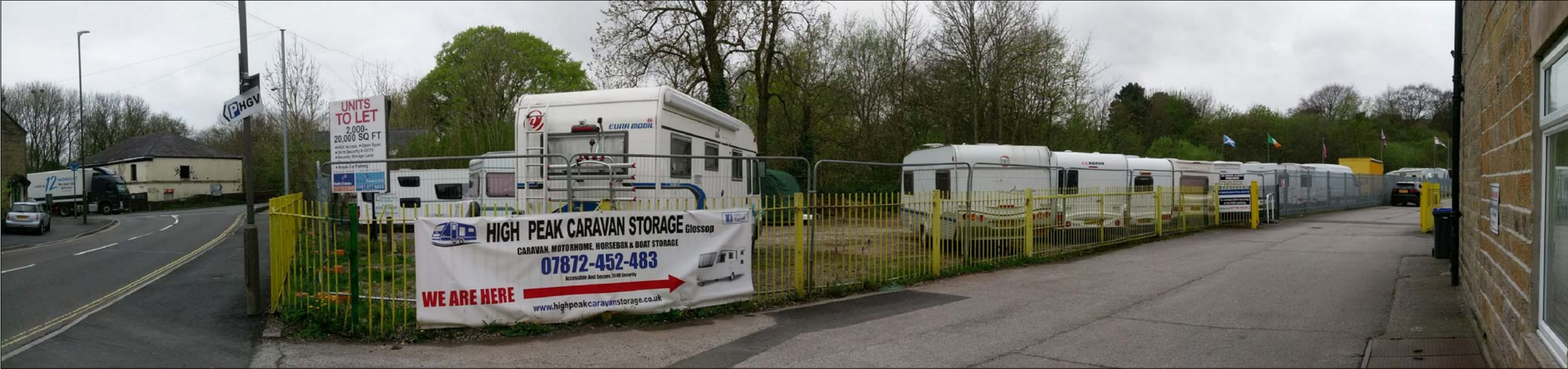
Photograph of application site frontage along Etherow Industrial Estate access road

Note: This drawing should not be scaled unless for planning application purposes. Work to figured dimensions only. All dimensions and levels to be checked on site. Land registry title and ownership boundaries are produced by Studio KMA using all reasonable endeavours. We cannot be held responsible for scale discrepancy of plans supplied to us. Any discrepancies should be reported to Studio KMA at the address below. This drawing should not be reproduced without written permission from Studio KMA. Drawing Amendment: rev date drawn checked - 28/04/17 CTW AT Initial Issue