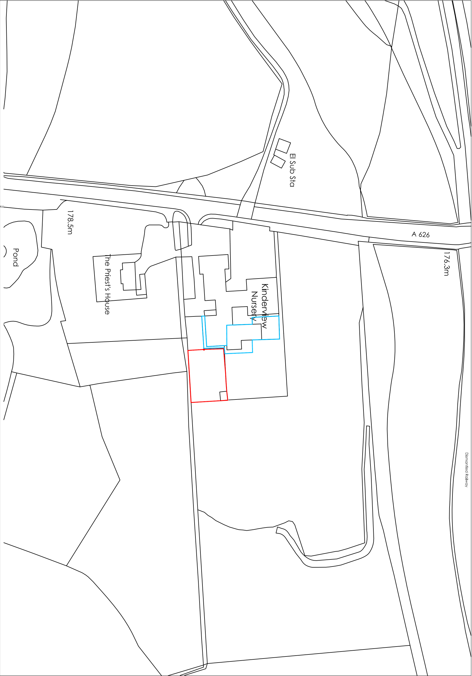
Location Plan (scale 1:1250)