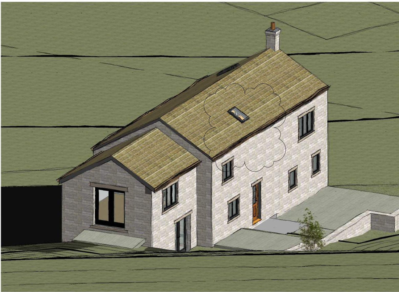
Proposed 3D from the Hillside