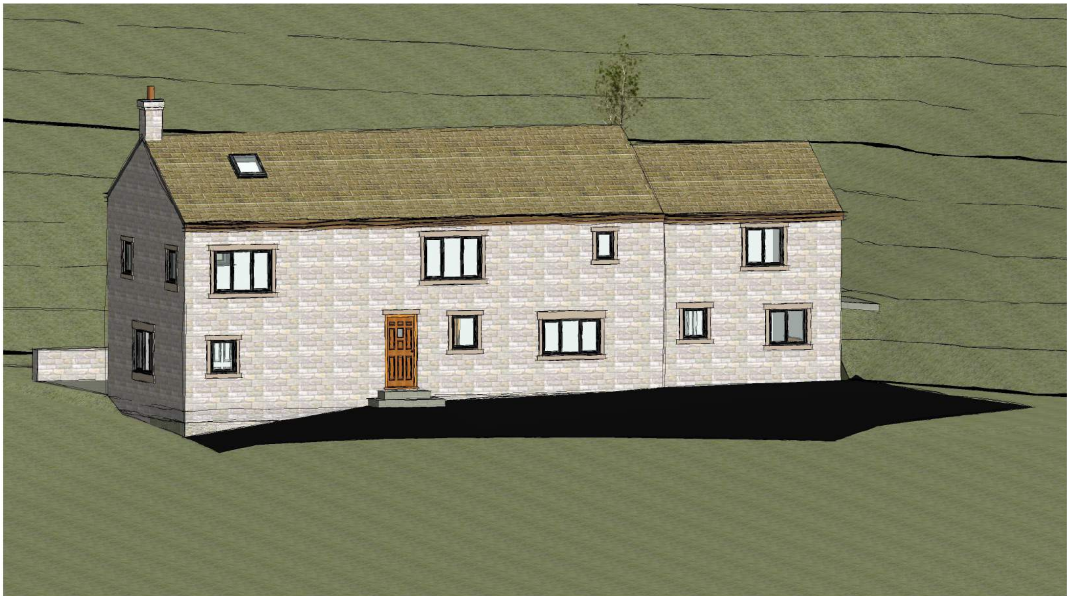
Proposed 3D from north-east