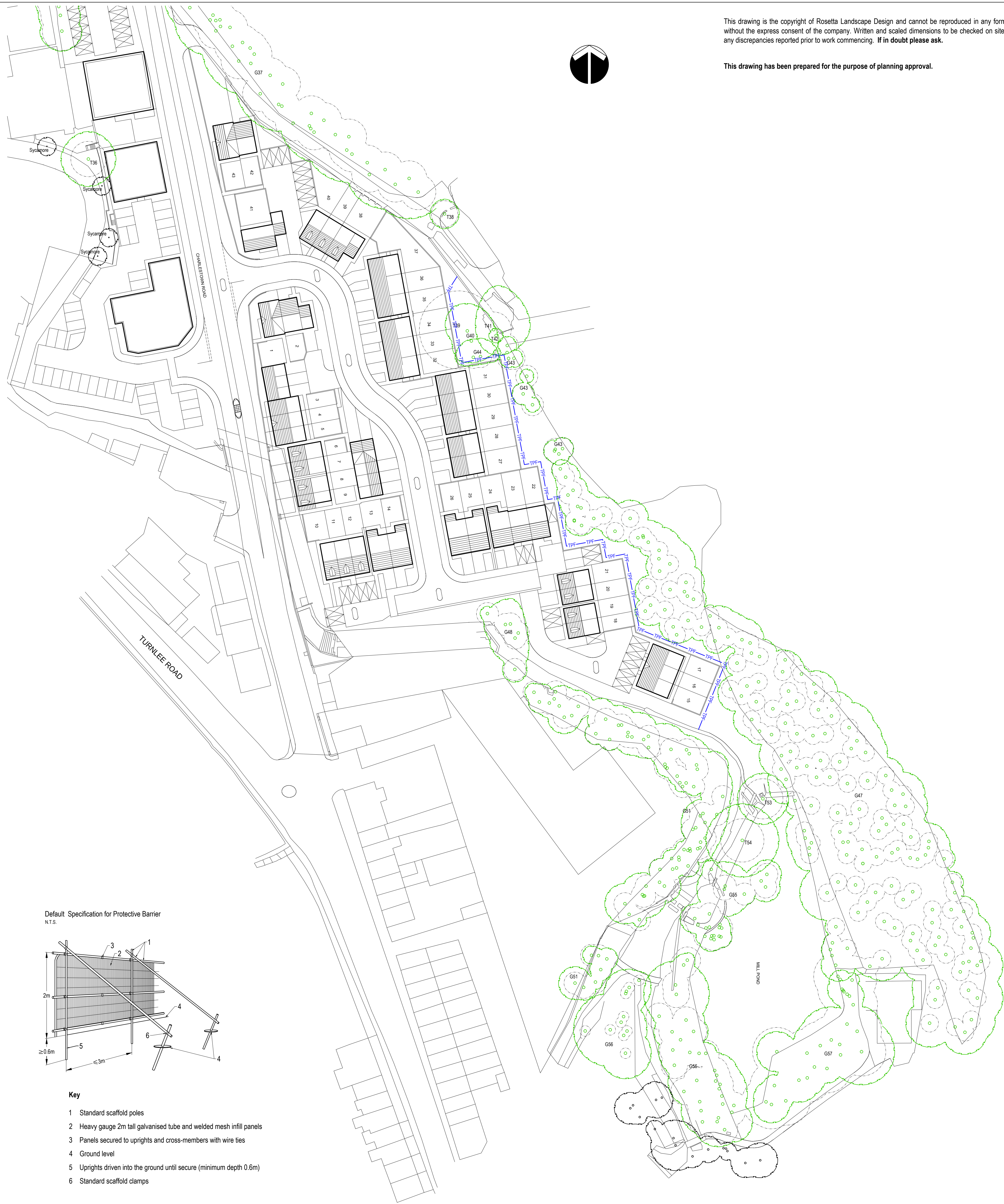
Default Specification for Protective Barrier N.T.S.