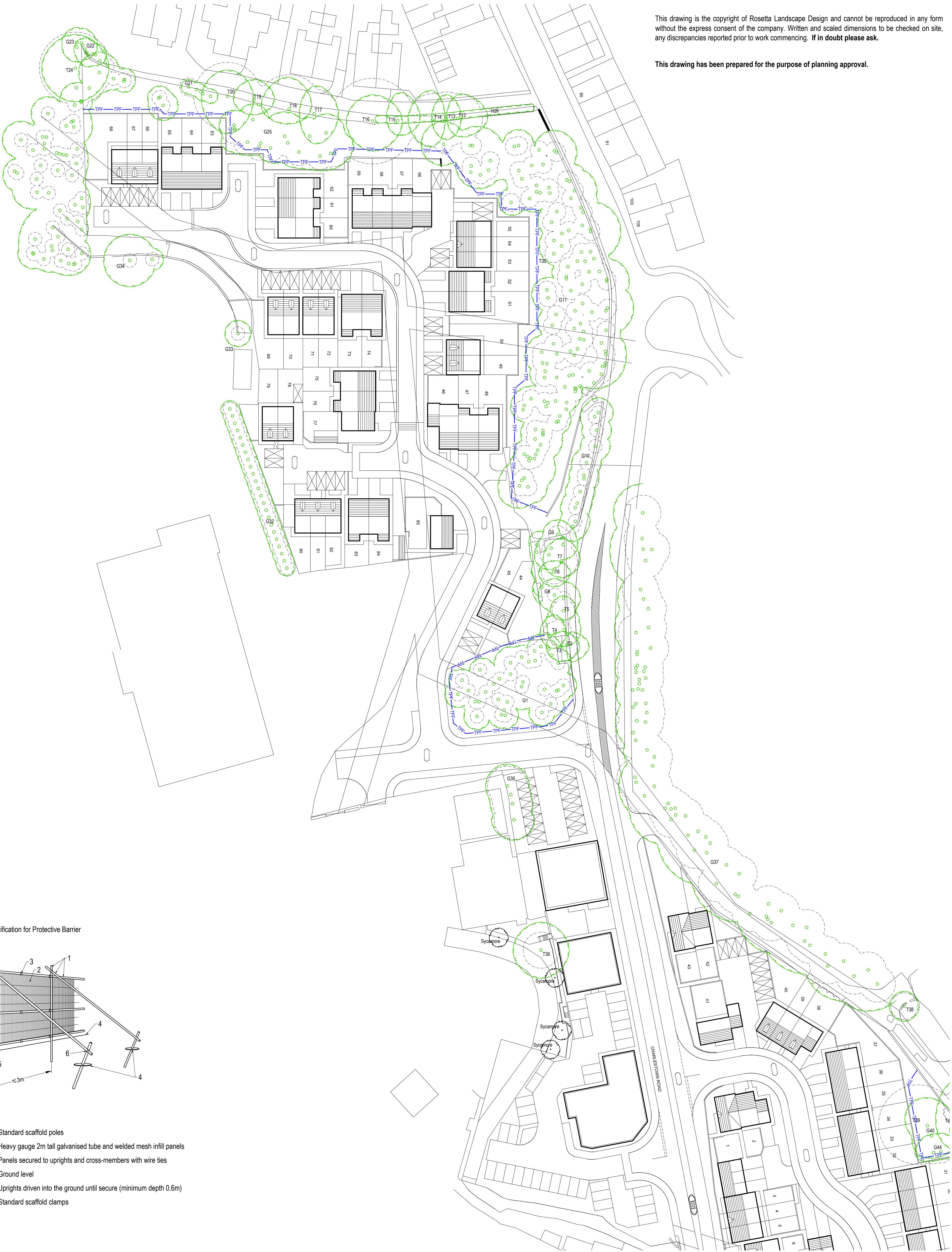
Default Specification for Protective Barrier N.T.S.

This drawing has been prepared for the purpose of planning approval.