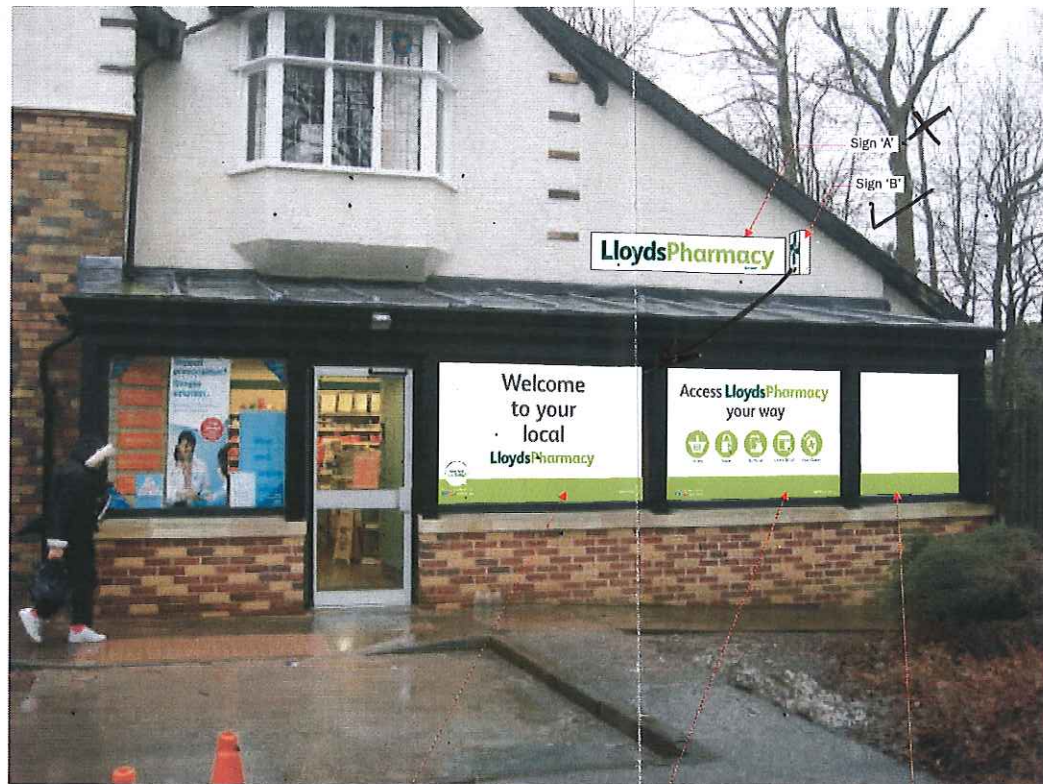
Sign 'C' Scale 1:25 Digitally printed vinyl graphic Size - 2025mm x 1235mm Text height - 150mm Ground level to underside of sign - 800mm