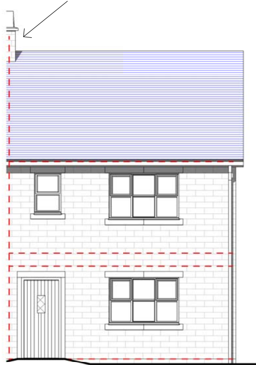
FRONT ELEVATION OVERVIEW 1 : 100

Chimney Position varies, Refer to Block Elevations