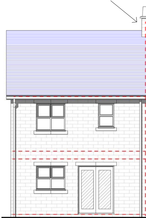
REAR ELEVATION OVERVIEW 1 : 100

Chimney Position varies, Refer to Block Elevations