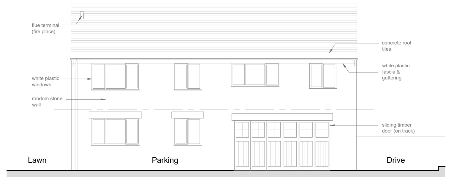
Rear Elevation (west)