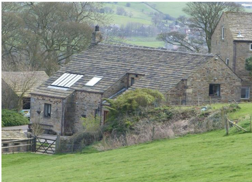
Figure 7 – Lower Barn at Briargrove Farm (April 2015)

This copy shows the entry on 02-Mar-2016 at 12:27:18.