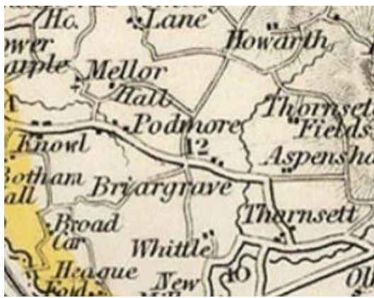
Figure 4 - 1843 map - J.C.Walker