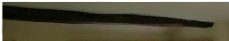
Figure 14 – Briargrove House. Period roof beam