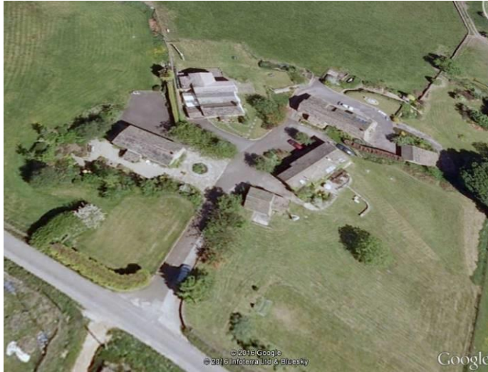
Figure 3 - Existing Location (Aerial view from Google earth)