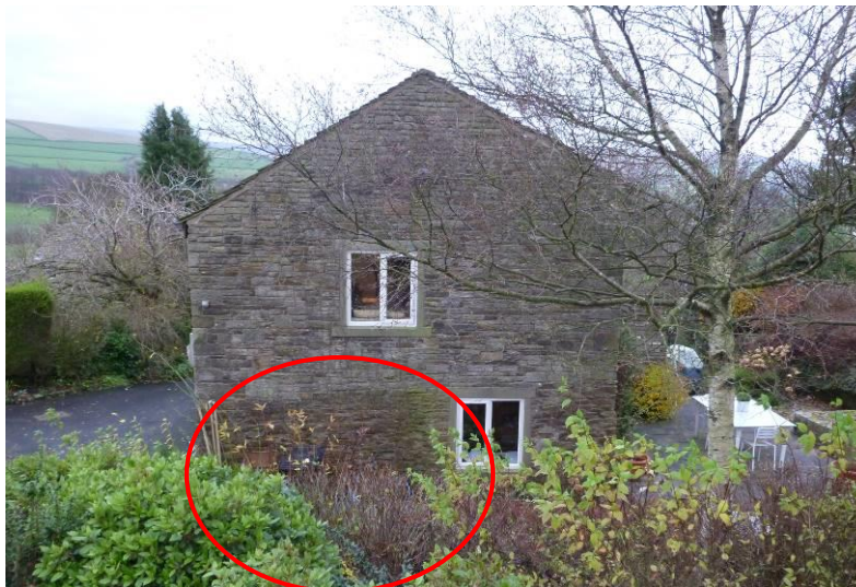
Figure 9 - Briargrove House (west). Old wall highlighted