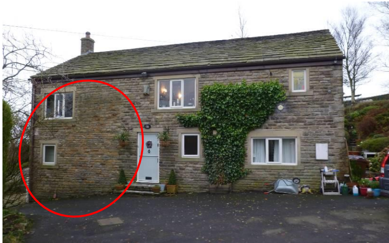
Figure 8 - Briargrove House (north). Old wall highlighted

All the doors, windows and stone surrounds are recent additions (1990's).