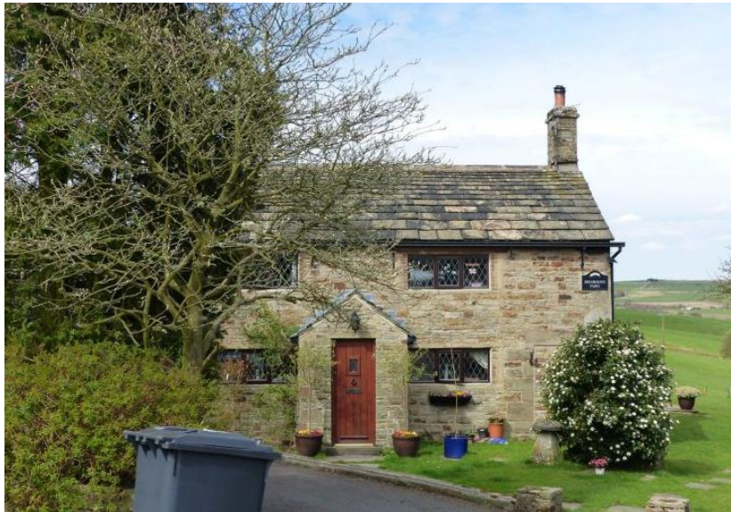
Figure 6 - Briargrove Farmhouse (April 2015)

This copy shows the entry on 02-Mar-2016 at 12:38:55.