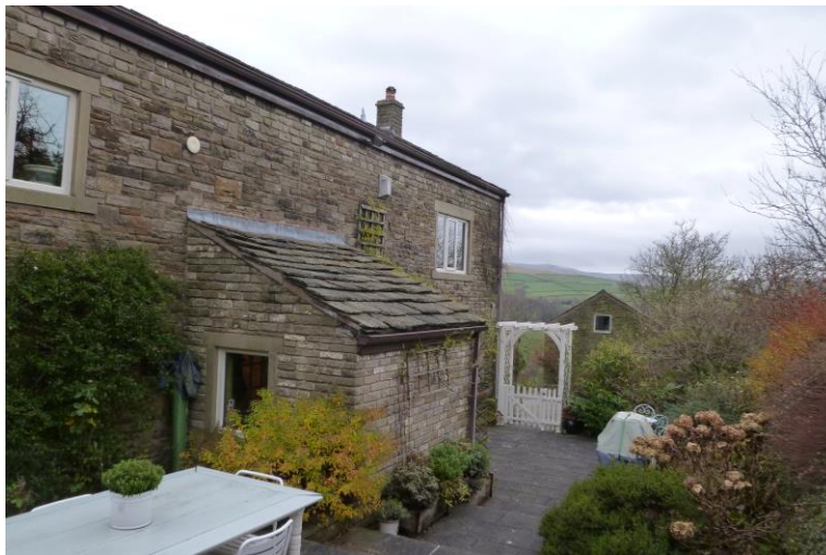
Figure 11 - Briargrove House (south). No old wall visible