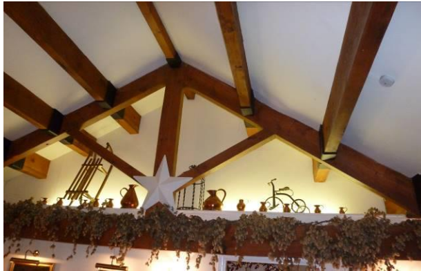
Figure 13 – Briargrove House. Original truss over dining hall