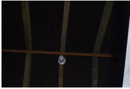
Figure 12 – Briargrove House. Conventional 1990's roof over kitchen