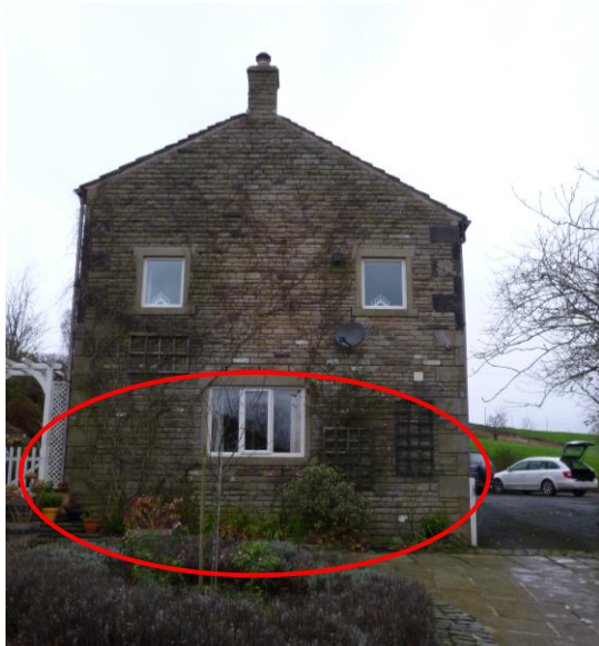
Figure 10 - Briargrove House (east). Possible old wall highlighted