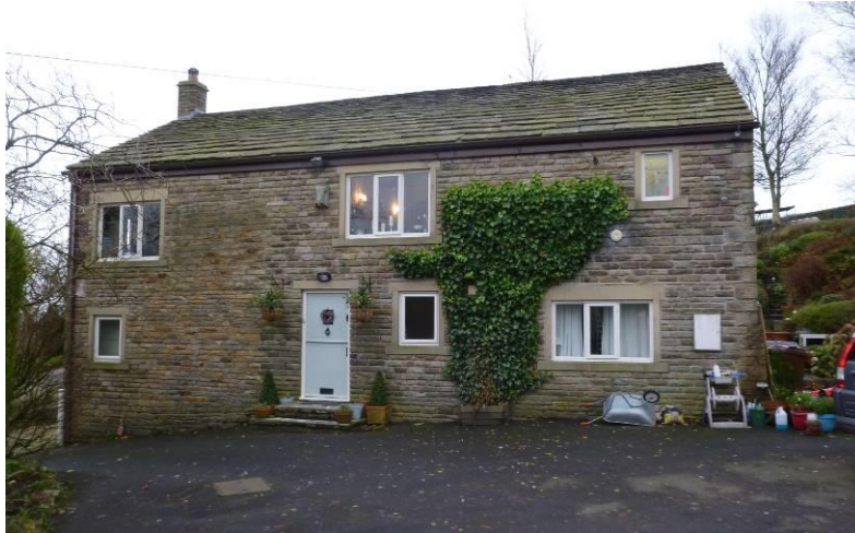
Figure 1 – Briargrove House. Existing north facade (rear)

Proposed addition of Glazed Barn Door, Two Storey Side Extension and Loft Balcony