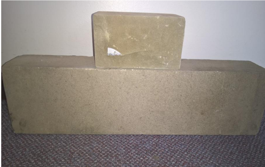
Coursed stone for front elevation and cast stone for headers, cills and mullions

PLANMART ARCHITECTURAL DESIGN CONSULTANTS 9 GEORGE STREET, GLOSSOP, DERBYSHIRE SK13 8AY. TELEPHONE:01457 863153 EMAIL: info@planmart.co.uk , WEB: www.planmart.co.uk