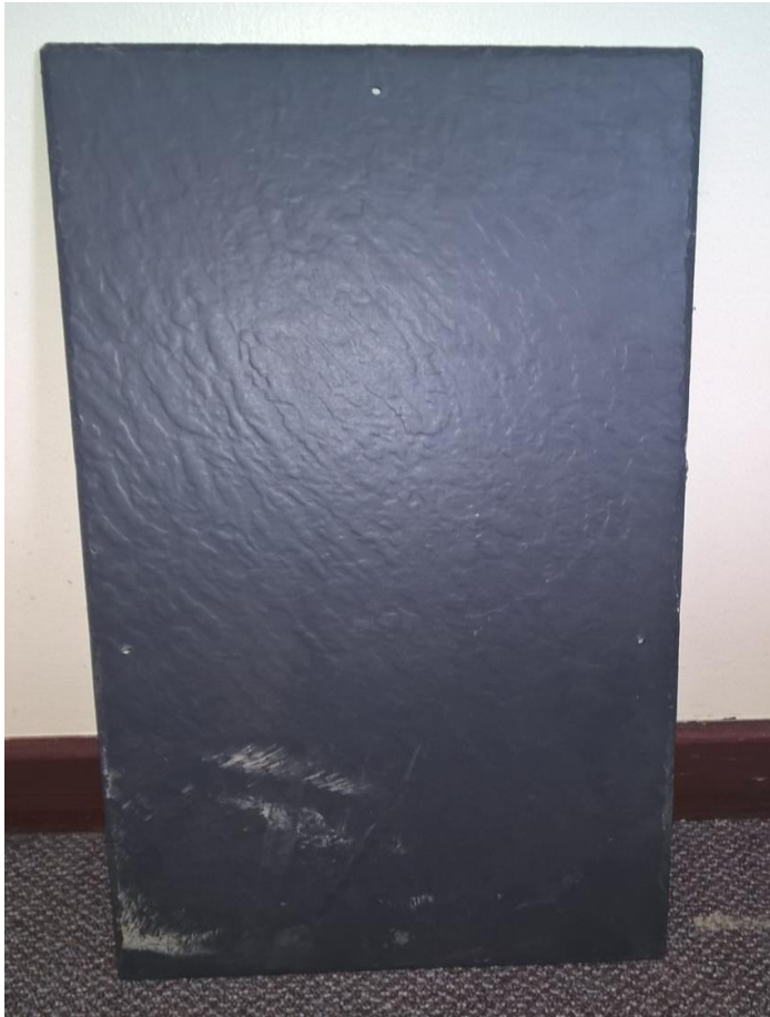
Sample of slate for roofing

PLANMART ARCHITECTURAL DESIGN CONSULTANTS 9 GEORGE STREET, GLOSSOP, DERBYSHIRE SK13 8AY. TELEPHONE:01457 863153 EMAIL: info@planmart.co.uk , WEB: www.planmart.co.uk