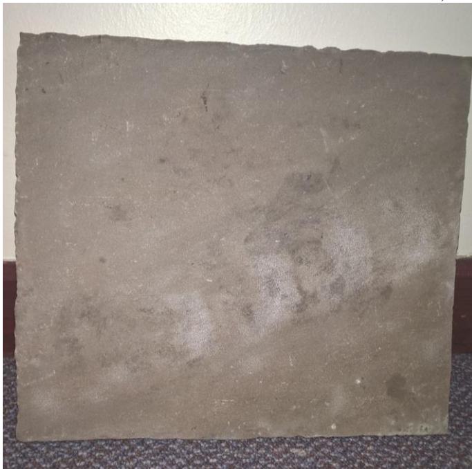
Indian flagstone paving