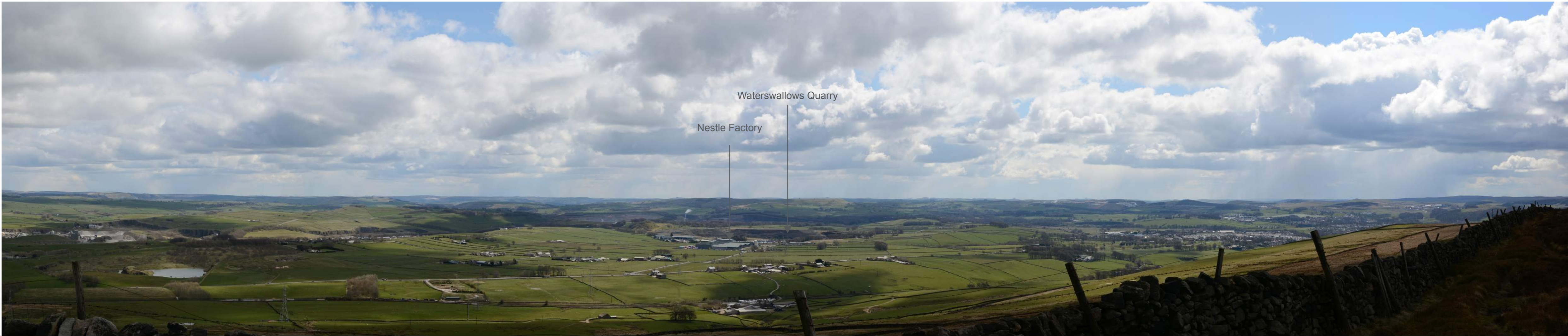
Figure 3a Viewpoint 3: Photograph - Existing Baseline View

■ Brook Holt ■ Blackburn Road ■ Sheffield ■ S61 2DW ■ tel: 0114 266 9292 ■ www.ecusltd.co.uk