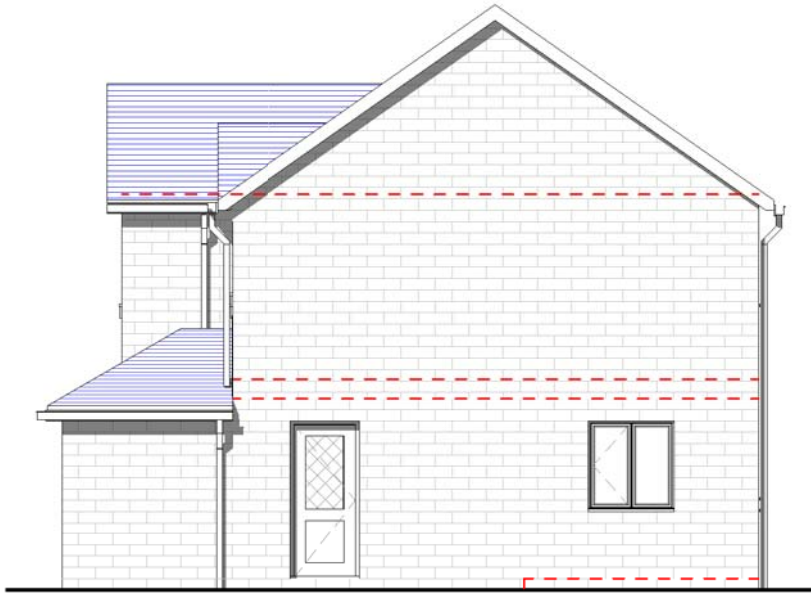
RIGHT SIDE ELEVATION OVERVIEW 1 : 100

All levels and dimensions must be checked on site by the contractor prior to commencement of works. Any variations must be reported to Millson Associates Ltd. All information hereon in is the copyright of Millson Associates Ltd. Copying in full or in part is forbidden without written permission from Millson Associates Ltd.