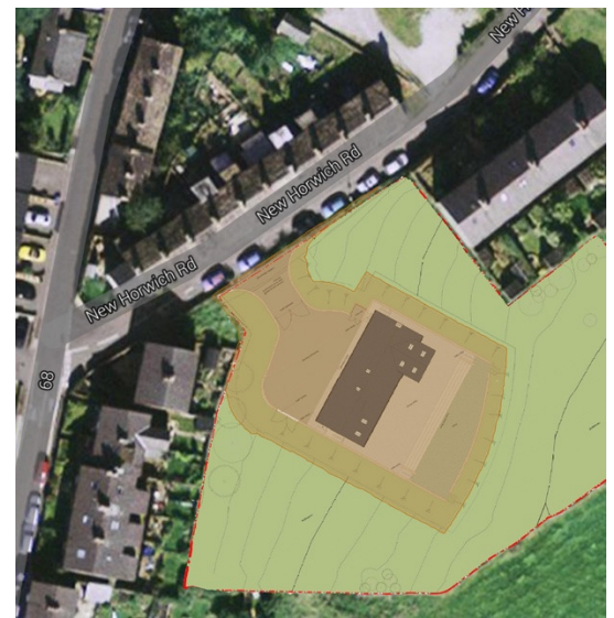
The image shows the proposed location of the house and entrance

If permission were to be granted for development of this site, given the very weight of construction traffic and earth moving machinery which would be required to remove very significant quantities of earth from the site, I hope that a full mining survey would be required by the planning authority before any development were to be permitted.