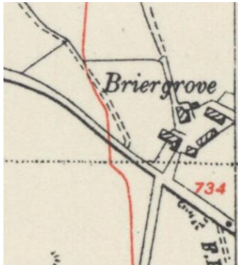
Figure 3 - 1948 Map

In 1948, the original buildings on the site covered a significantly larger area, and were 'L'shaped. The two plans are overlaid in Drawing 391-01.