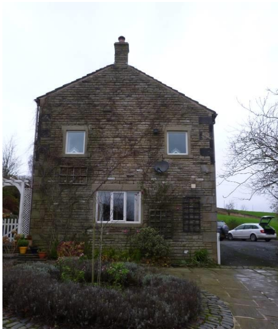
Figure 6 - Existing east elevation