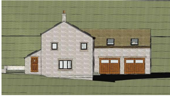
Figure 8 - Proposed east elevation