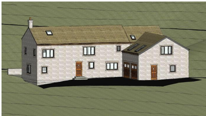
Figure 9 - Proposed view from north-east