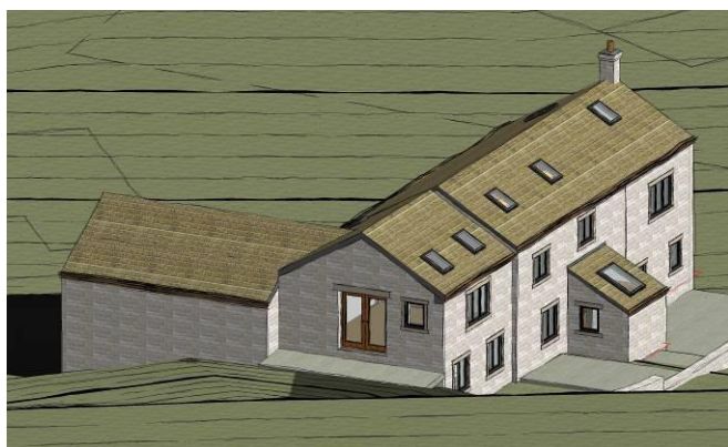
Figure 7 - Proposed south-west corner (view from hill)

The proposed extension will have most glazing to the south west corner of the first floor, to improve passive solar heating and daylight levels. No new windows overlook neighboring properties.