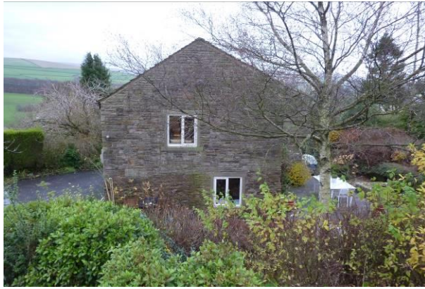
Figure 5 - Existing west facade