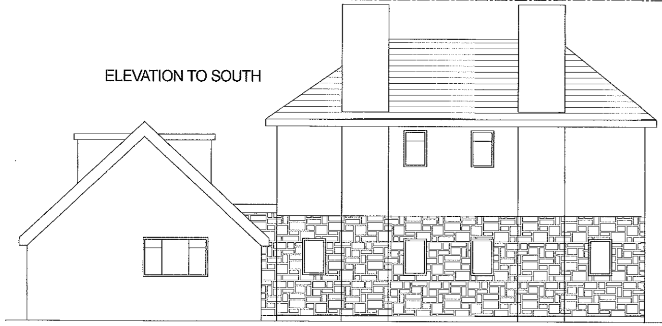
ELEVATION TO SOUTH