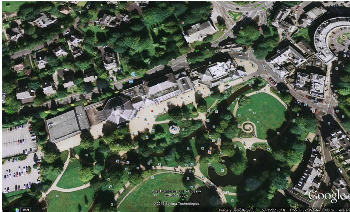
Aerial view of Pavilion Gardens

The site forms part of the Pavilion Gardens complex, St Johns Road, Buxton located to the west of the town centre. The historic gardens cover 23 acres and along with the associated historic buildings provide a significant visitor destination within the heart of the town centre.