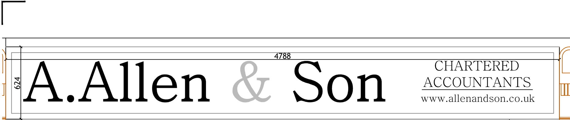
Sign Front - A-A Scale 1:20

Signs to be aluminium / die cast metal seamlessly fixed to exterior grade plywood (if require). Lettering to stand proud of signage face.