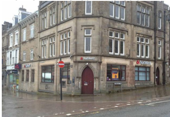
EXISTING SHOP FRONT ELEVATION