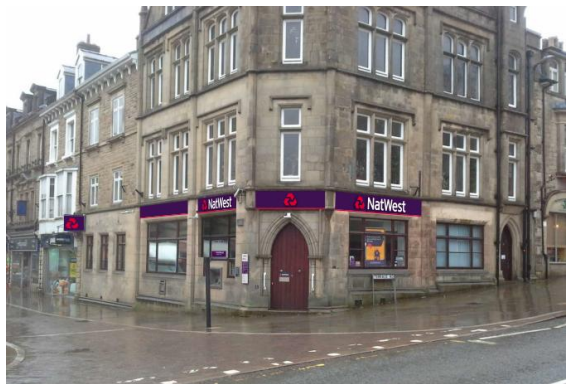
PROPOSED SHOP FRONT ELEVATION