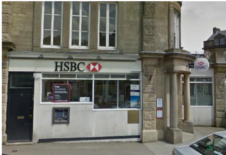
Nearby bank has externally illuminated fascia and internally illuminated projecting sign.

SEPTEMBER 2013- Proposed advertisement consent..... APPROVED