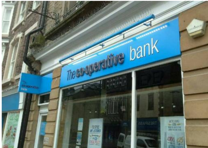
Shops next door have externally illuminated fascias and an externally illuminated Heritage Hanging sign.