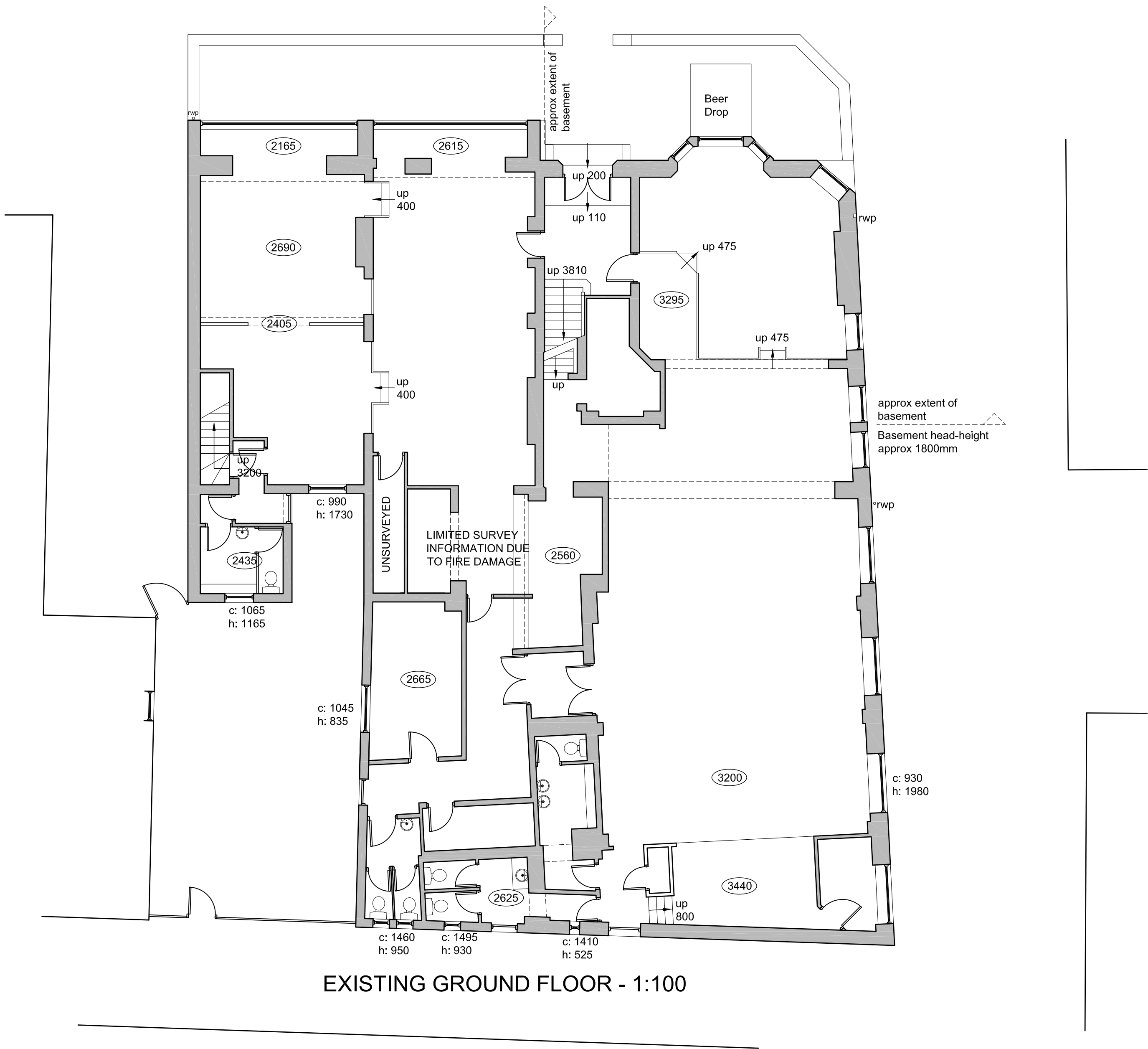
EXISTING GROUND FLOOR - 1:100