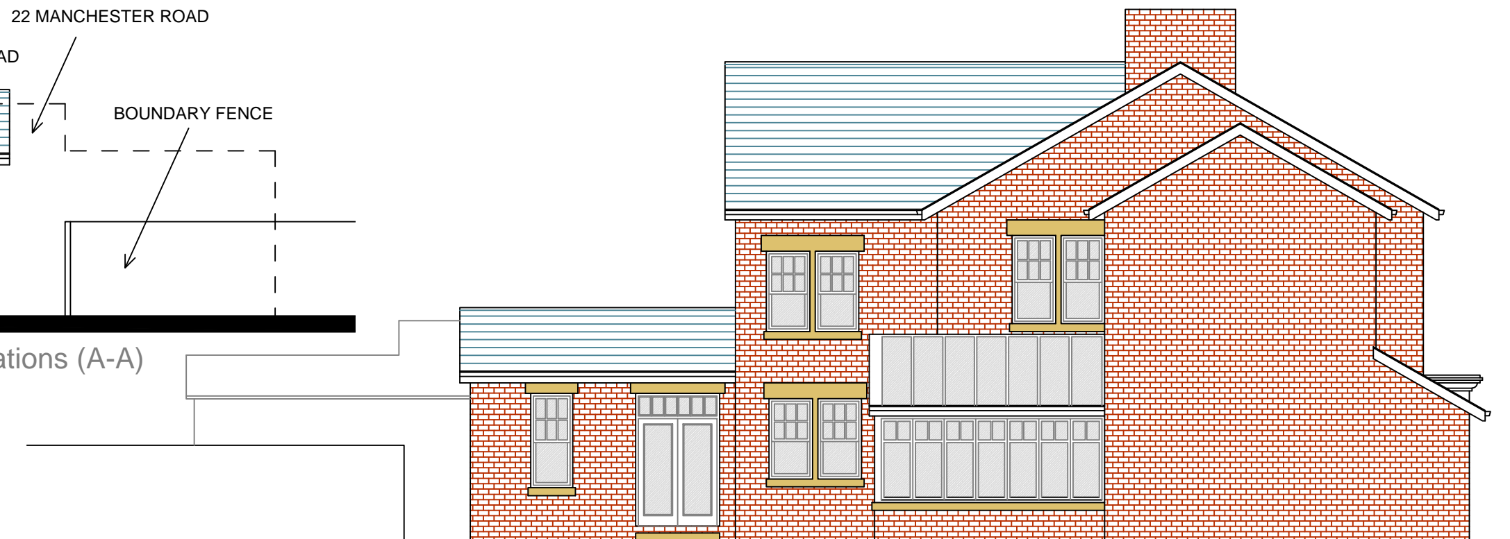
Proposed West Gable Elevations

Gable Elevations 24 Manchester Road Chapel-en-le-Frith Proposed Plans and Elevations Scale 1:100 @ A3