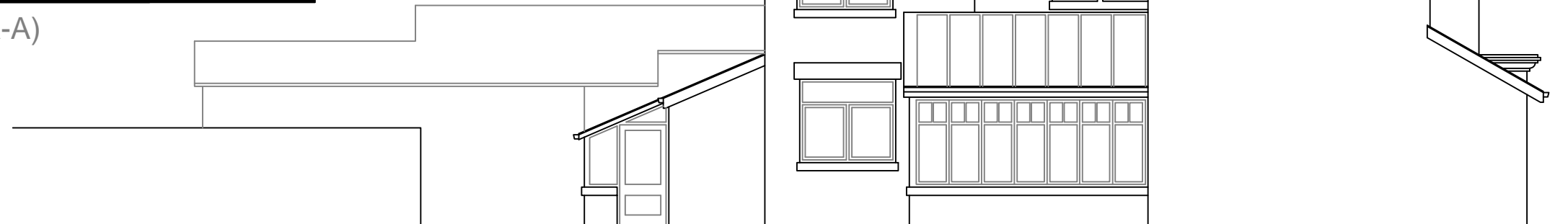
Existing West Gable Elevations