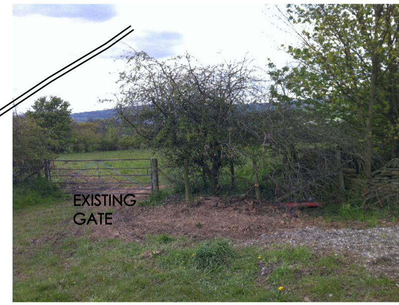
PHOTO 1 ENTRANCE TO FIELD WITH STABLE BLOCK